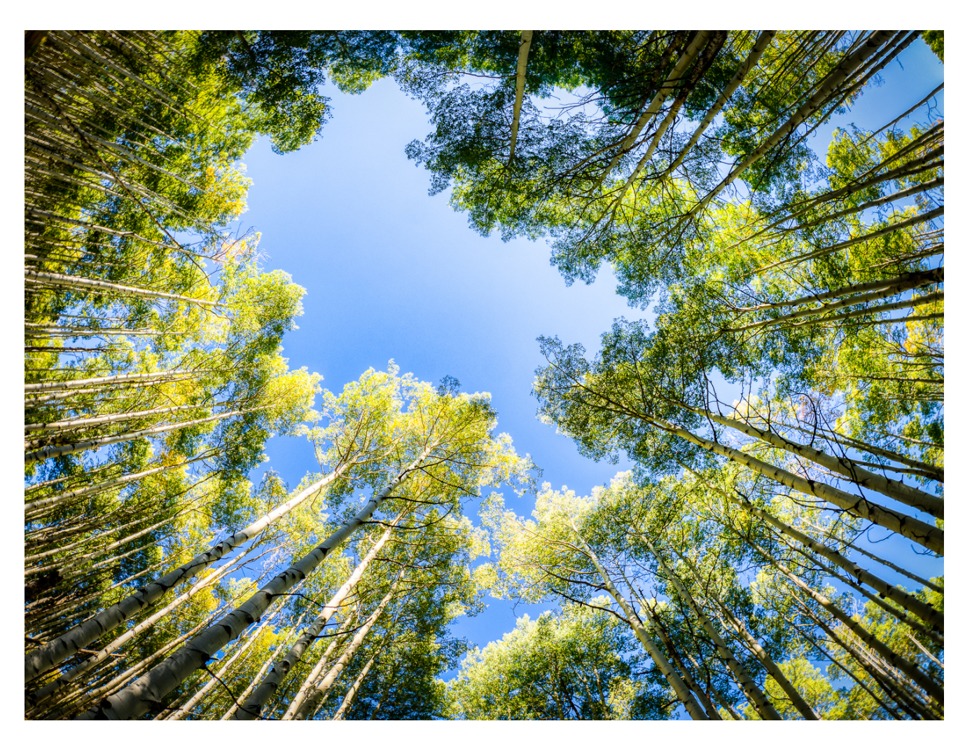
"Looking Up" by Bob Panick

This was taken in an Aspen Grove near Crested Butte during a workshop run by Mandy Lee Photo (<a href="https://www.mandyleaphoto.com/">https://www.mandyleaphoto.com/</a>). Where we were shooting is a fairly large grove of Aspen. I made this shot using a fisheye lens pointed straight up using the back display swiveled out so I could compose it. Even though a fisheye has very deep depth of field, I still shot it at f/8 (FFE of f/16), using my OMDS OM-1. I shot this handheld using a 5 shot burst with 0, -2, -4, +2, +4 stops of EV compensation, but only used the first four. I then used Skylum Aurora (IMHO the best HDR software out there, blows the doors off LR or PS) to merge and tweak it. Then final edits were done in Lightroom. The reason I didn't use a tripod is that this was the last day of the workshop, late in the day and I was getting very tired and just didn't feel like setting up the tripod.